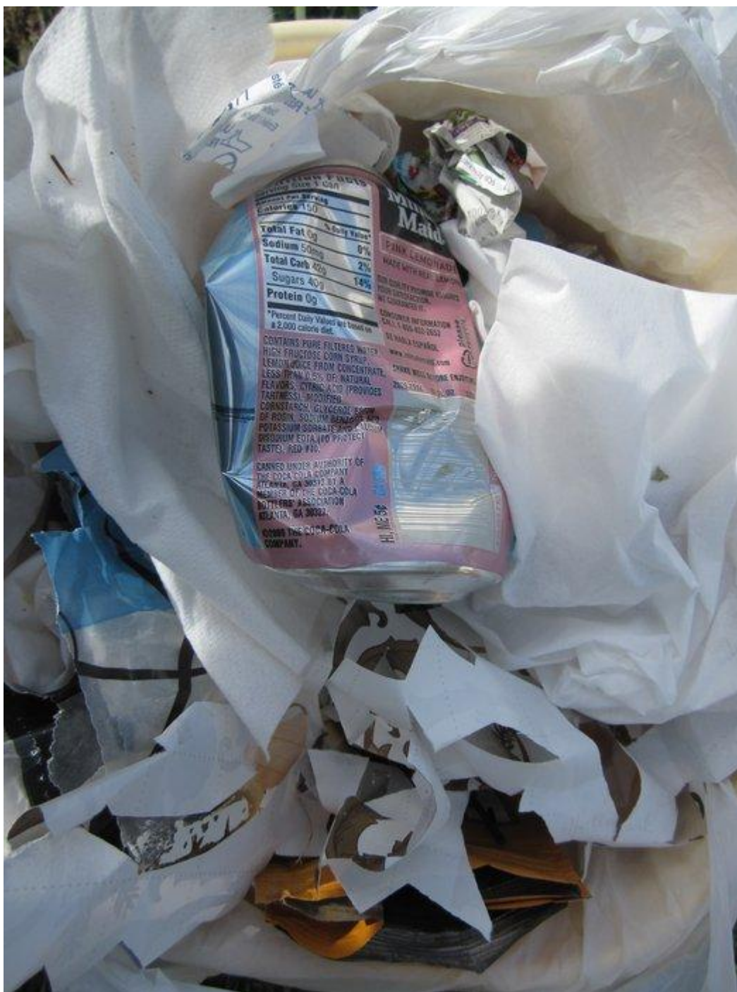
WASTED CAN — One of billions of non-recycled aluminum cans — Get Photo ( /photos/wasted-can/ )