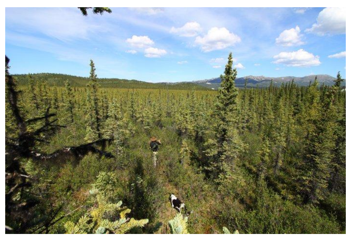
ENERGY FRONTIER — The site of the proposed Emma Creek Power Energy Project and Healy CTL project. — Get Photo (/photos/energy-frontier/)

In 2007 a feasibility study (http://www.netl.doe.gov/File%20Library/Research/Coal/energy%20systems/gasification/pubs/FINAL-Healy-FT-1251-07062007.pdf)(3.6 Mb) was completed regarding a proposed 14,600 barrel (around 7300 tons of coal) per day coal-to-liquids (CoalToLiquids.html) (CTL) plant in Healy, near the Usibelli coal mine (UsibelliCoalMine.html) to supply liquid fuels to refineries within Alaska. Possible customers include the Flint Hills (http://www.fhr.com/refining/alaska.aspx) and PetroStar refineries in