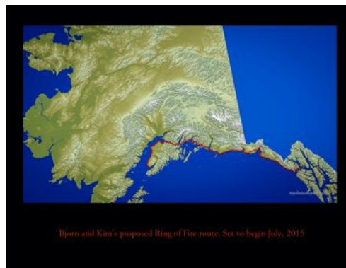
Bjorn and Kim's 2015 summer fat-bike/packraft route.