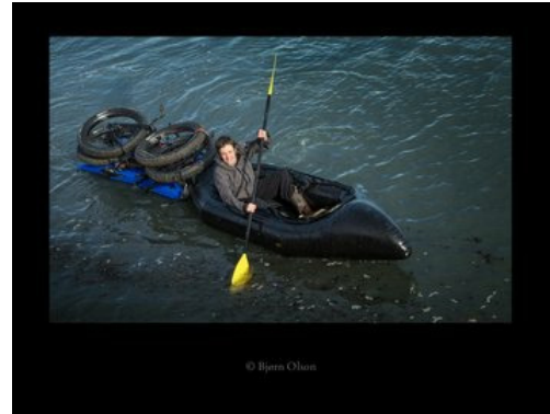
Alpaca Gnu and trailer