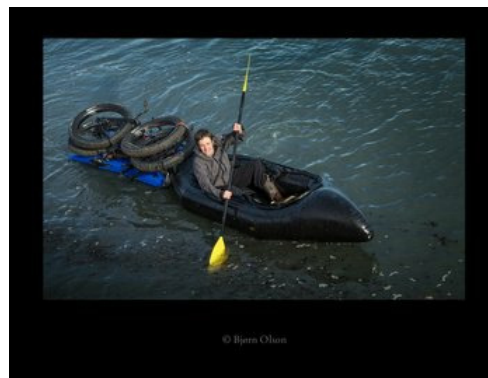
Alpaca Gnu and trailer