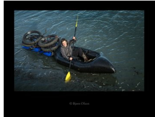
Alpaca Gnu and trailer