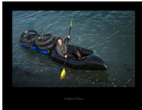
Alpaca Gnu and trailer