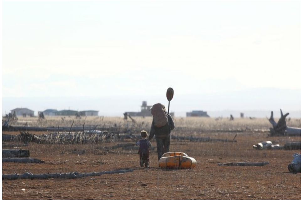
Hig and Katmai approach some cabins on the Susitna Flats, towing the packraft for slough crossings.