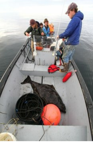
A large halibut caught as part of the rural Alaskan subsistence fishery

The state also defines a separate "personal use" fishery for Alaskans only which regulates non-subsistence personal use of fishing gear such as gill nets, traps, and fish wheels. The permitting for these activities is distinct, but the harvest data are usually combined, and both are managed in a similar manner. In reality this fishery more or less just allows a subsistence-style harvest for Alaskans who live outside of designated subsistence zones.