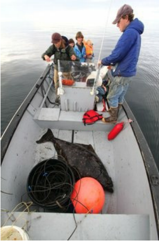
A large halibut caught as part of the rural Alaskan subsistence fishery

The state also defines a separate "personal use" fishery for Alaskans only which regulates non-subsistence personal use of fishing gear such as gill nets, traps, and fish wheels. The permitting for these activities is distinct, but the harvest data are usually combined, and both are managed in a similar manner. In reality this fishery more or less just allows a subsistence-style harvest for Alaskans who live outside of designated subsistence zones.