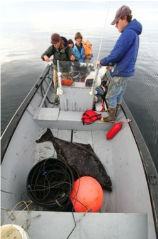
A large halibut caught as part of the rural Alaskan subsistence fishery

The state also defines a separate " personal use " fishery for Alaskans only which regulates non-subsistence personal use of fishing gear such as gill nets, traps, and fish wheels. The permitting for these activities is distinct, but the harvest data are usually combined, and both are managed in a similar manner. In reality this fishery more or less just allows a subsistence-style harvest for Alaskans who live outside of designated subsistence zones.